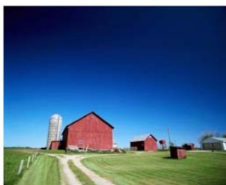
50 acres of farmland in the AR zoning district yields 100 development rights